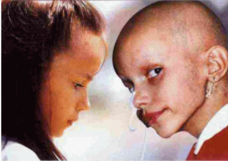
BEFORE AND DURING CHEMO-TREATMENT